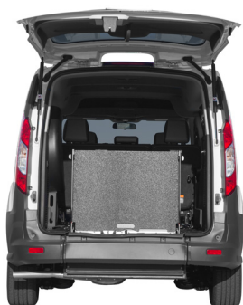
Before — Vertical