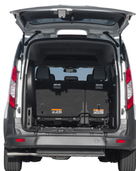
After — Flat