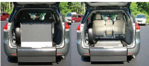
Before — Vertical