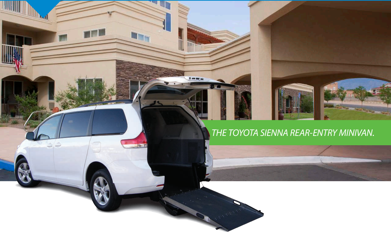
THE TOYOTA SIENNA REAR-ENTRY MINIVAN.

The Toyota Sienna was rated by leading automotive magazines as having the best power, handling and steering among minivan choices. The Toyota Sienna Rear-Entry from MobilityWorks® Commercial also features the widest ramp (36") and the highest ramp capacity (1,000 lbs.) available in the industry.